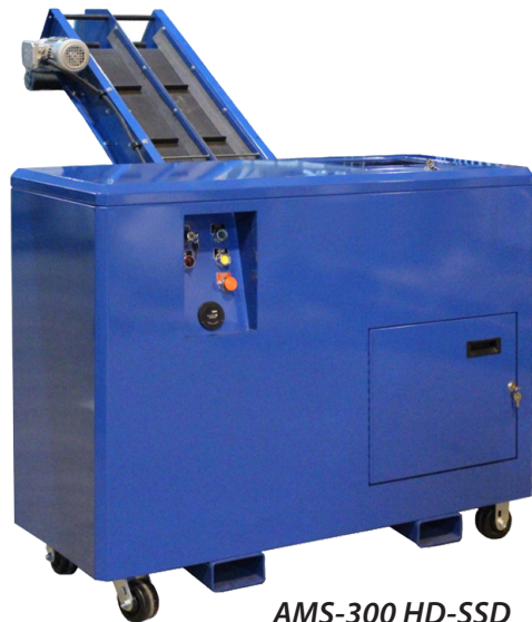
AMS-300 HD-SSD shown with optional output conveyor

Also includes waste bin full/door open indicator with auto stop and energy savings mode.