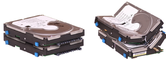
Hard Drives Before Crushing